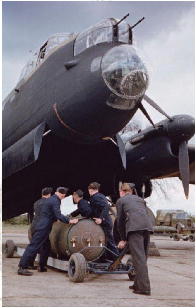
Troops Loading a Lancaster.